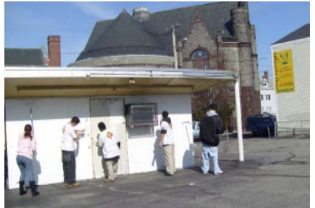
March 2008, Graffiti Removal with partners Youth Build & Providence Police Department

Keep lawns mowed and free of litter. If you are having trouble growing your lawn visit your local lawn care store and speak to a representative that can advise you. Also try putting up blockades to keep people from walking over the trouble spots.