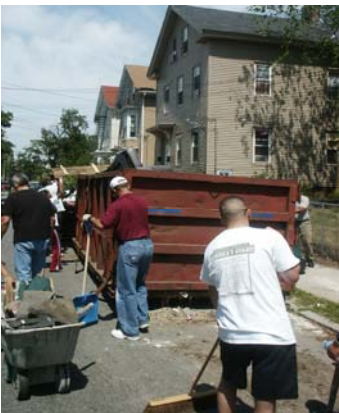
Neighborhood Clean-up June 2006

No matter if you own or rent your home, you should want to keep it clean and beautiful, even if its not much. I researched some tips to help you in your endeavors.