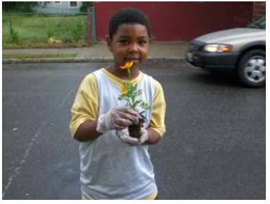
Neighborhood Clean-up June 2007

the lawn, flowers can be used to line a sidewalk or the pathway to your front door. Splashes of color can add charm and beauty to any yard.