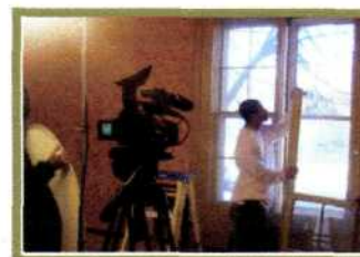
Taping of the Lead-Safe Work Practice DVD