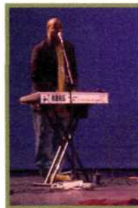
"I'll be Home for Christmas", gospel concert