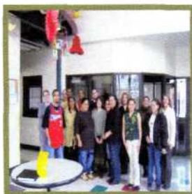
Financial Fitness students

120 affordable and safe rental units have been created between Westfield Lofts, Stephens Apartments and Bellevue Avenue.