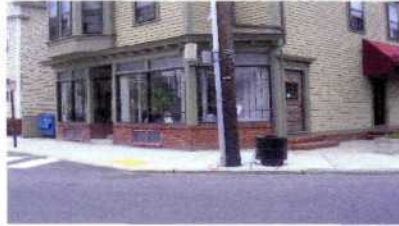
Ultisimo Beauty Salon